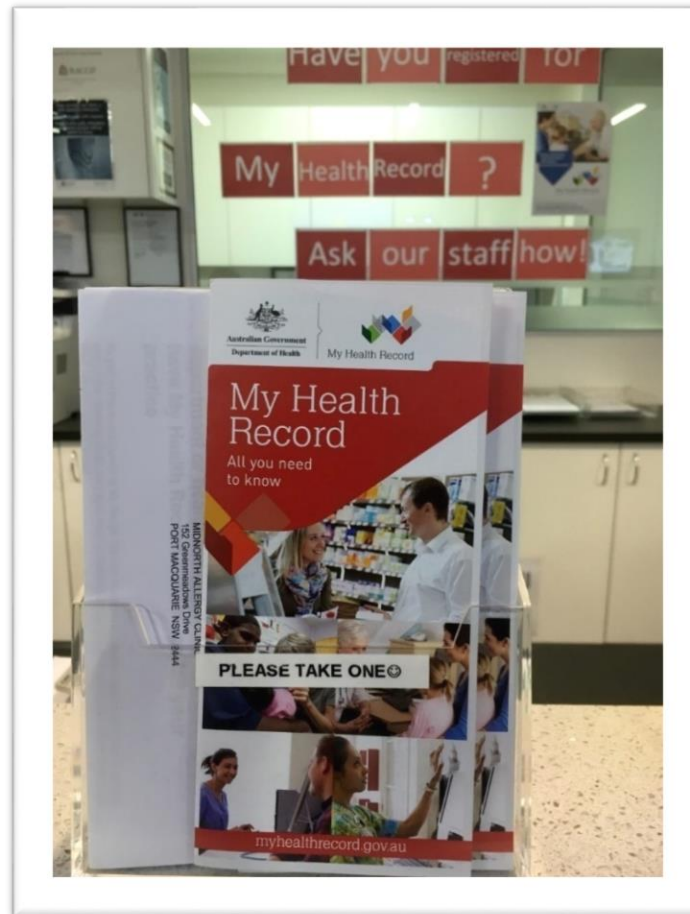
Greenmeadows Medical, Port Macquarie, NSW