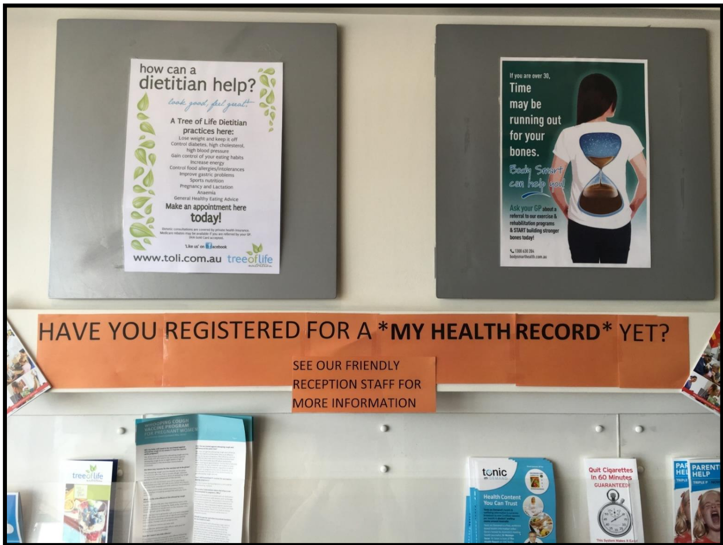
Garden City Medical Centre, Brisbane